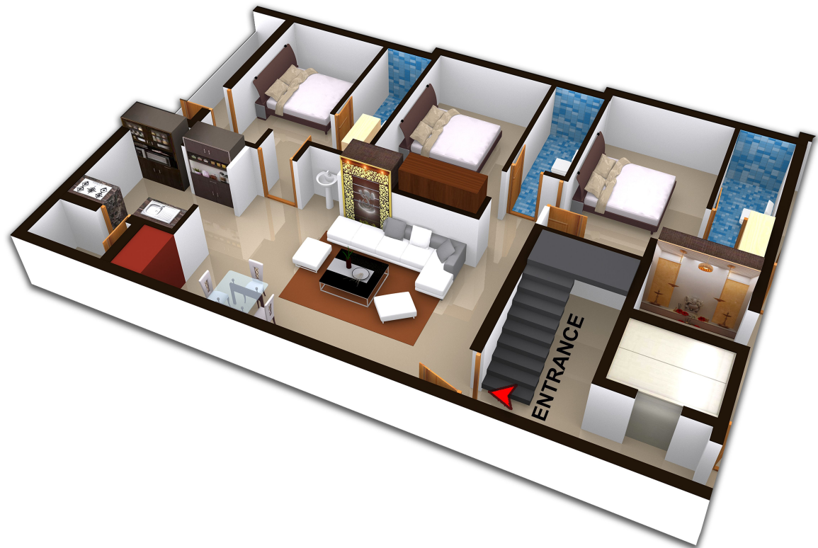
FLAT -1A,2A - FLOOR PLAN